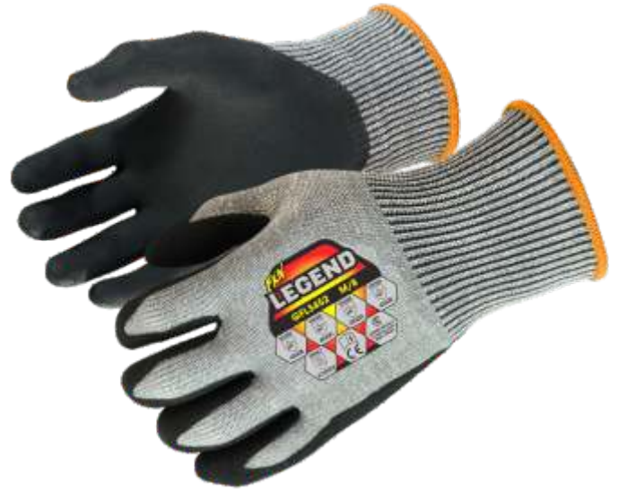
Part No: GFL345